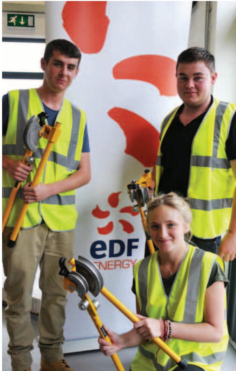
Students at an Enterprise Centre opening day in Somerset

EDF Energy already runs successful apprenticeships and graduate schemes, which will be expanded to support Sizewell C.