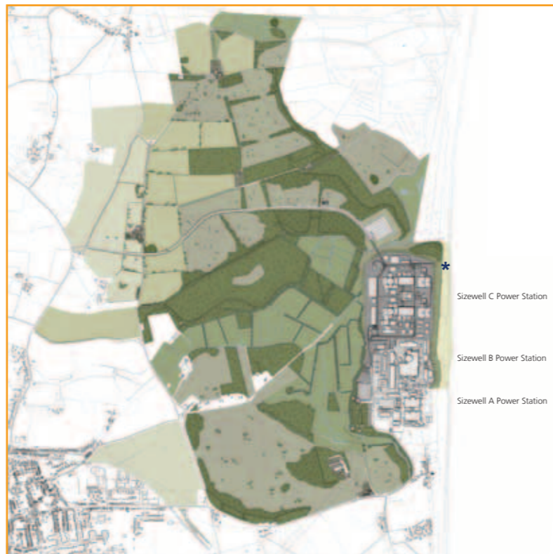
Indicative operational landscape plan.